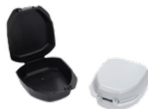
#9575615 Black Strap Box 12/Pkg #9575635 Gray Strap Box 12/Pkg

This is an ideal box for a mouthguard with an attached helmet strap. The cases are made of high-density polypropylene with a hinged lid. A slit on the front of the box allows for the mouthguard strap to come out of the box. We provide personal imprinting for this product as well.