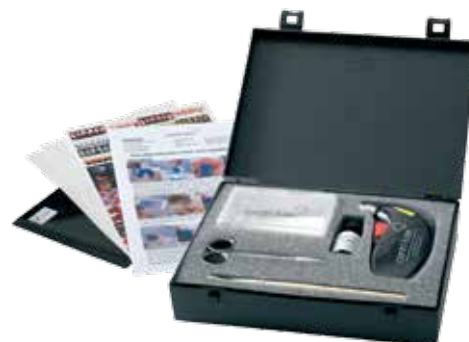
#1009100 centri-fuse Kit #1009101 centri-fuse Replacement Sheets

With this kit, you're able to meet the growing demand of custom mouthguards. The centri-fuse system will let you print anything you want and fuse it to a vacuum formed mouthguard, making it truly a custom mouthguard.