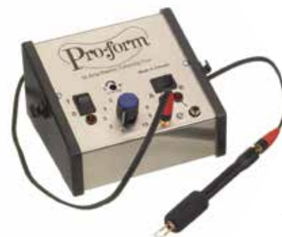
#9144730 Electric Knife, 110V

The 10 amps allow you to cut most materials easily and smoothly by providing extra heat at the tip. Excellent for bleaching trays, impression trays, splints, mouthguards and more.