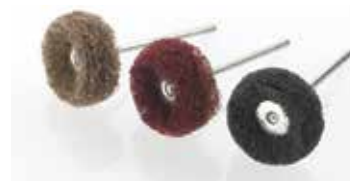
#1670016 Coarse, 5,000 rpm #1670092 Medium, 5,000 rpm #1670091 Fine, 5,000 rpm

Mounted on mandrel. Same application as Polishing Discs with Scotch Brite™. Available in packs of 12.