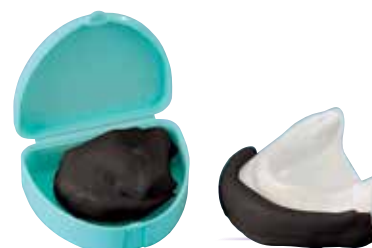
#1570210 Block Out Compound, Black, 1 lb. (453 g)

This Block Out Compound is used to block out areas of models or can be rolled around a model base for easy periphery trimming. The reusable material will not melt under heat or stick to models, plastics or vacuum formers.