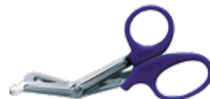
#9139720 Utility Scissors

These All-Purpose Utility Scissors are great for bulk trimming of thermoplastics, especially Pro-form mouthguards. The easy grip handle and stainless steel construction is very handy throughout the lab or office.