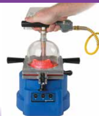
#9594050 Pressure Dome

This new attachment works in conjunction with Keystone Industries' vacuum formers to create a better fitting dental appliance. The dome uses positive pressure during vacuuming allowing for a form-fitting mold of thermoplastics. The Pressure Dome hooks into any existing air compressor lines (needs 80 PSI line pressure with 3/8 line) to provide extra pressure when adapting thermoplastics over an existing model. It will fit over any vacuum unit that makes 5" x 5" (12.7 x 12.7 cm) plastics. Works great for making laminated mouthguards, heavy-duty splints, hard/soft dual laminated splints, Proflex base plates, model duplication, orthodontic retainers and more.