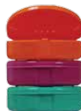
#9575185 Assorted Marble #9575165 Yellow #9575191 New Age Lime #9575128 Marble Blue/White #9575125 Green #9575195 New Age Pink #9575129 Marble Pink/White #9575190 Assorted #9575192 New Age Orange #9575127 Marble Black/White #9574460 Beige #9575196 New Age Purple #9575115 Light Blue #9575105 Red #9575193 New Age Aqua #9575135 Dark Blue #9575194 New Age Lavender #9575155 White #9575197 New Age Assorted

High Gloss Ortho Boxes are perfect for storing mouthguards, retainers, bleaching trays and splints. Made of flexible plastic, the box has a hinge design and secure latching system to ensure maximum protection. The box is 3/4-inch (19 mm) deep. Available in packages of 12. Imprinting available, see page 8.